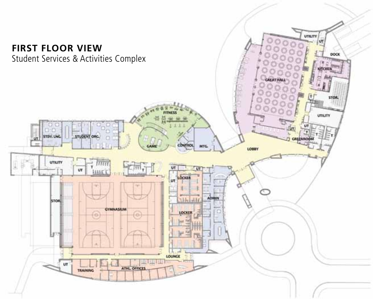
Student Services & Activities Complex